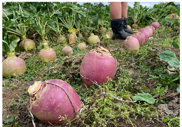
Figure 2: Massie Swede demonstrating uniform bulb size and colour in foreground with higher drymatter type Triumph behind.